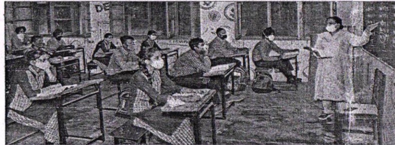
The government has posted 15 Punjabi teachers from 10 districts as language officers.

In its move to implement the State Language Act, the state government last week had announced to depute 15 district language officers (DLOs). However, instead of making new recruitment, the Higher Education and Languages Department has chosen 15 Punjabi teachers from 10 districts and issued orders to post them as DLOs on deputation. Among these 15 teachers, ordered to be posted on deputation as DLOs, three are from Faridkot, two from Fazilka, Bathinda, and Patiala (each), and one each from Mansa, Kapurthala, Moga, Ferozepur, Mohali and